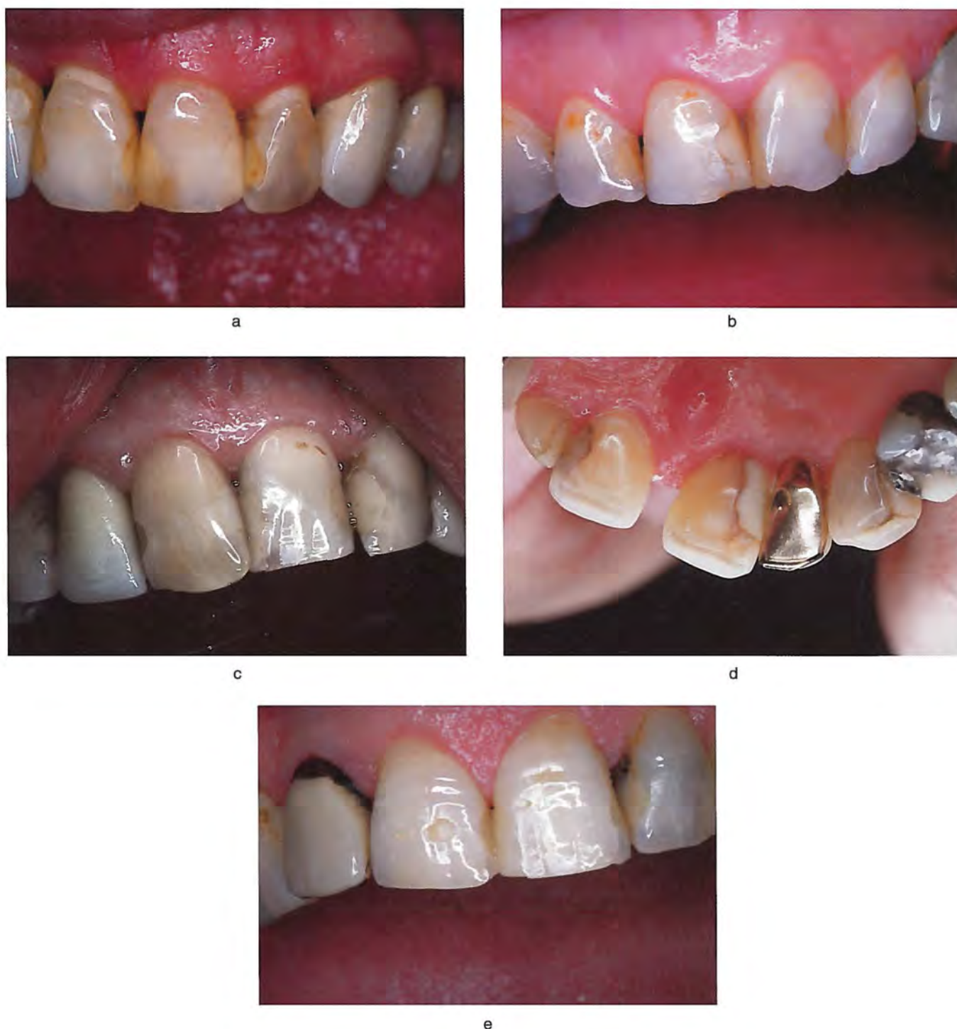
Figure 5 (a–e). 'Quality' has a different meaning for different individuals, patients and dentists alike.

of composite veneers and artificial resin teeth the effects of consumption behaviour, such as coffee, tea and smoking, and cleaning habits on discolouration was evaluated. No significant influence on discolouration could be detected 238 .