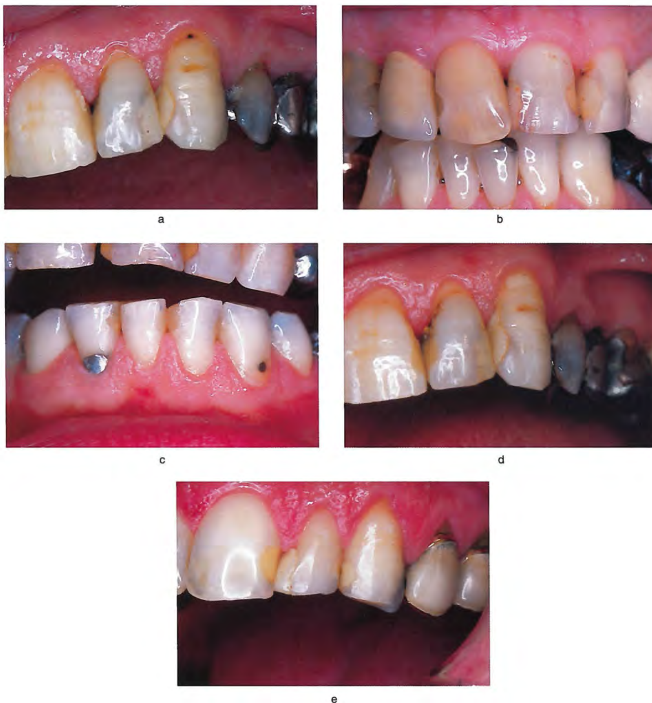
Figure 4 (a–e). Old composite resin restorations remaining in situ due to patient satisfaction. Other patients, as well as clinicians, might well consider the restorations 'unacceptable'.

caries risk increases significantly. Wood et al. 183 studied 54 pairs of Class V amalgam and glass-ionomer cement restorations over two years in 36 xerostomic cancer patients. Survival times were very short (8.5 months) for all restorations. Among the individuals using fluoride, 8 per cent of the glass-