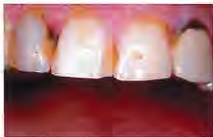
Figure 1. Risk considerations of three restorations. 1. Is the remaining tooth integrity intact on both laterals? 2. Are the periodontal tissues damaged? 3. Are remaining tooth tissues jeopardised by the discrepancies in the restorations? 4. Will any of the restorations wear or degrade to an unacceptable level before the next appointment?

due to other reasons. With these points in mind, quality of a dental restoration can be described in terms of: